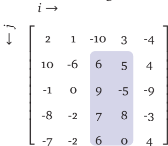
Figure 2. Example: The output is the sum of the greatest rectangle sum (30 in the case of the array above.).